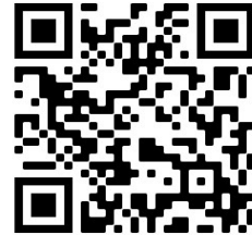
QR Code for Registration